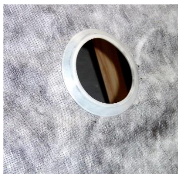
Seal ring installed.