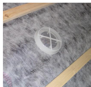
The mesh cover in place.

Roofing accessories supplied from J.A. Plast match roof profile, colour and surface 100%. The current product list and further information can be found on our homepage, www.japlast.com .