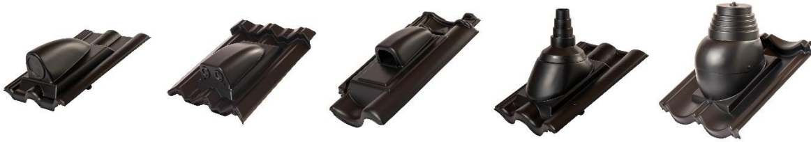
Figure 1 Tubetile TT1, Tubetile TT2, Bird and Bat Tile, AZ and GS.

Below are pictures of the five products covered by this EPD.